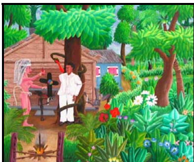
Wedding Ceremony A.M. Maurice c. 1998 24 x 20 inches Acrylic on Canvas