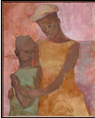
Sister and Brother