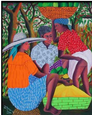
Marchandes (Market Women)