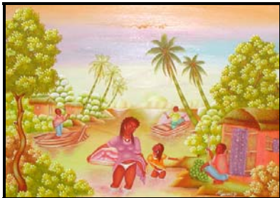
Mother and Daughter