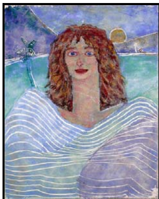
Fille de Mer