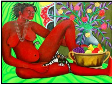
Nude with Cat and Flowers